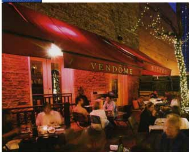
PATIO OF LIGHTS: Bistro Vendôme's authentic, impeccable Gallic fare, served en plein air, transports you to the 1st arrondissement and the romantic rues of Paris.